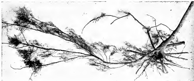
Root System of Once-Transplanted Tree

THE natural tendency of roots, left to themselves, is to spread